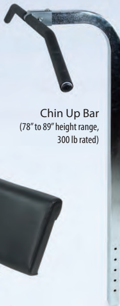
Chin Up Bar (78" to 89" height range, 300 lb rated)