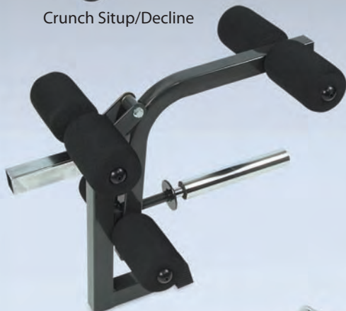
Leg Extension/Curl (Fits standard and Olympic plates. 200 lb rated)