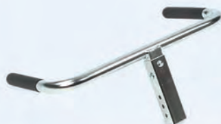
Bar Dip/Leg Raise Handles (24" wide, 350 lb rated)