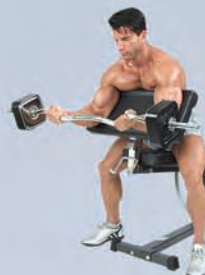
E-Z BAR CURL