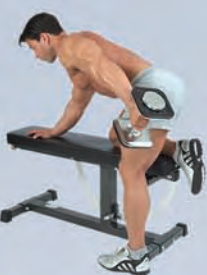
TRI KICK BACKS