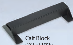
Calf Block (20" L x 3 1/2" H)