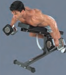
REAR SHOULDER FLYES