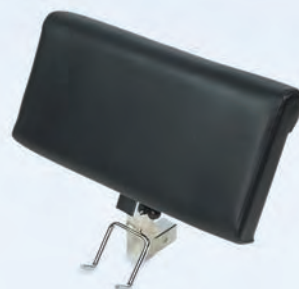
Preacher Curl Pad (Angle adjustable)