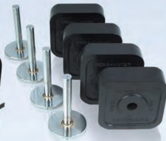
120 lb. Add-on Kit