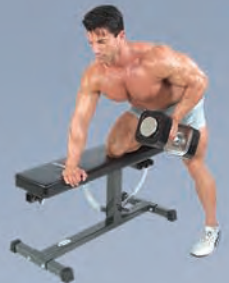
ONE ARM ROWS