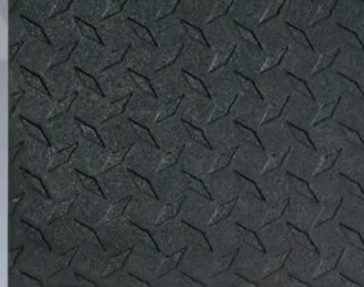
4' x 6' x 1/2" Rubber Mat