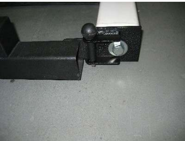
IM400/500/700 Style Brackets – Right side view