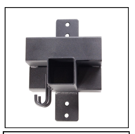
CORRECT MOUNTING ORIENTATION