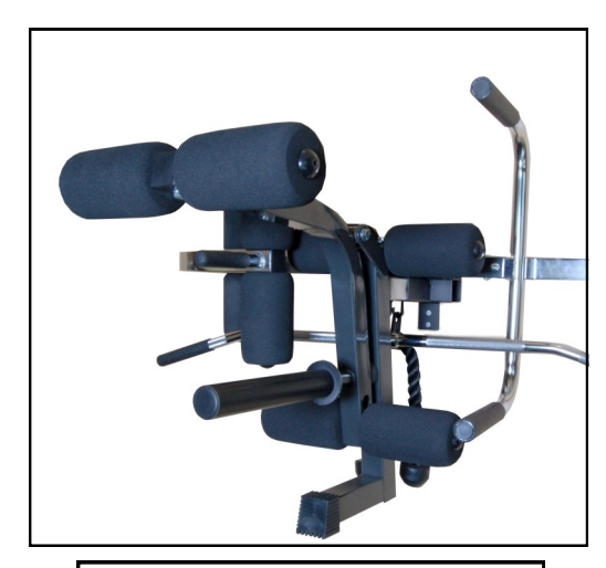
Shown on wall with Ironmaster accessories (Not Included)

Installation: If you are unsure of proper wall mounting procedure, please seek the advice of a professional.