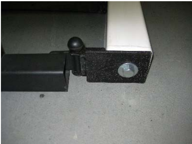
IM950/1000 Style Brackets – Right side view