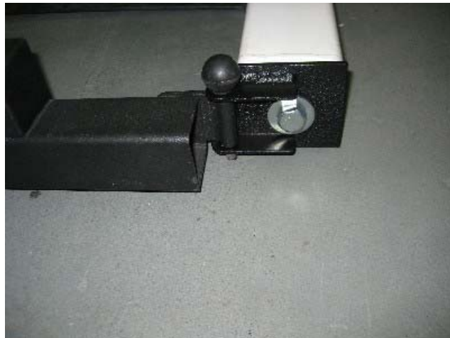
IM400/500/700 Style Brackets – Right side view